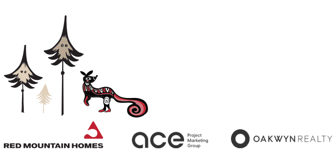
E. & O. E. This is not an offering for sale. Any such offering may only be made with a Disclosure Statement. The developer reserves the right to modify or change plans, specifications, features, materials and prices without notice and at the developer's sole discretion. While we strive for accuracy, all measurements are approximate and are based on the architectural plans. Renderings are conceptual and are intended as a general reference only. Price ranges are estimated with best accuracy at time of publication, exclude taxes, are subject to availability at time of purchase, and are subject to change.